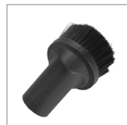
SOFT BRUSH NOZZLE