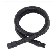
Φ38*1.5M SPRING HOSE