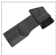
2 IN 1 NOZZLE